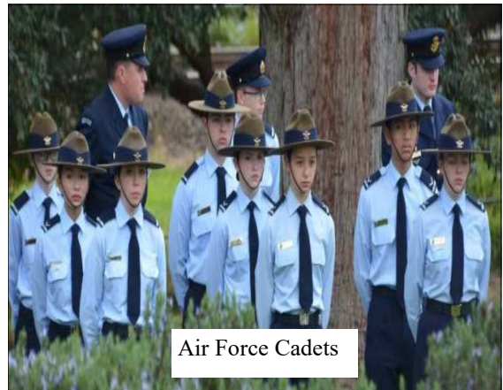
Air Force Cadets