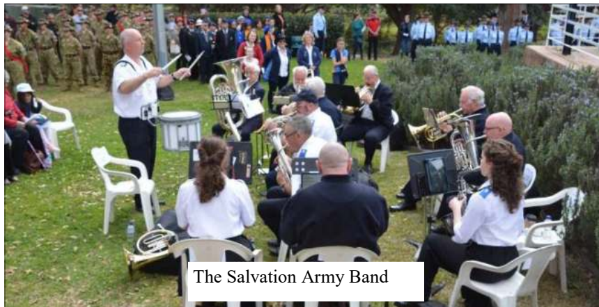
The Salvation Army Band