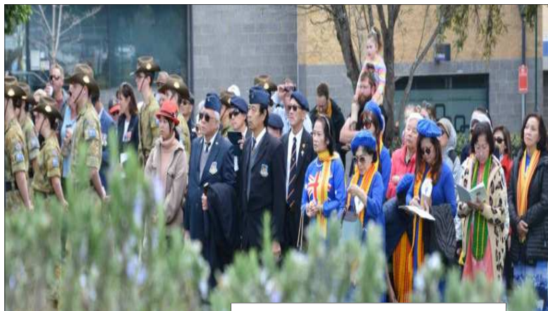
Audience Members at the Service